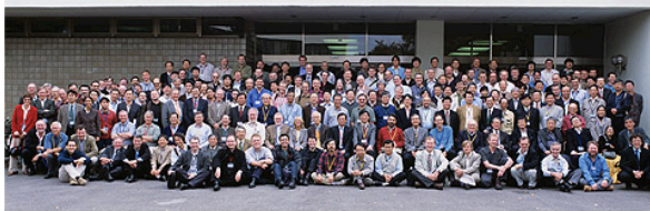
Participants at the First ILC Workshop (Nov.13, 2004)

Towards an International Design of a Linear Collider, Nov.13-15, 2004, KEK