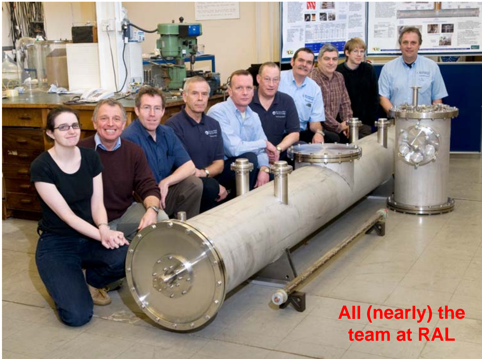
All (nearly) the team at RAL