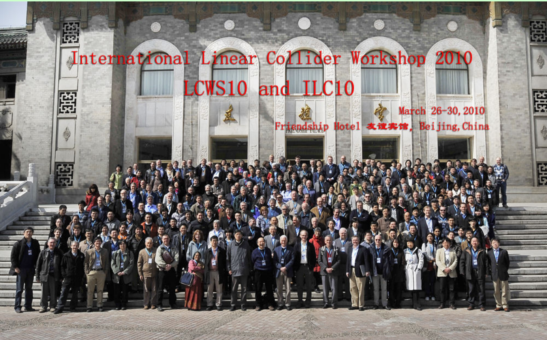
LCWS10, Friendship Hotel, Beijing