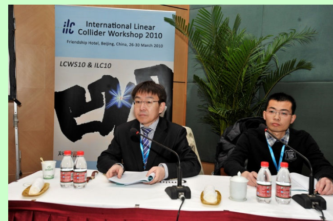
LCWS10, Friendship Hotel, Beijing