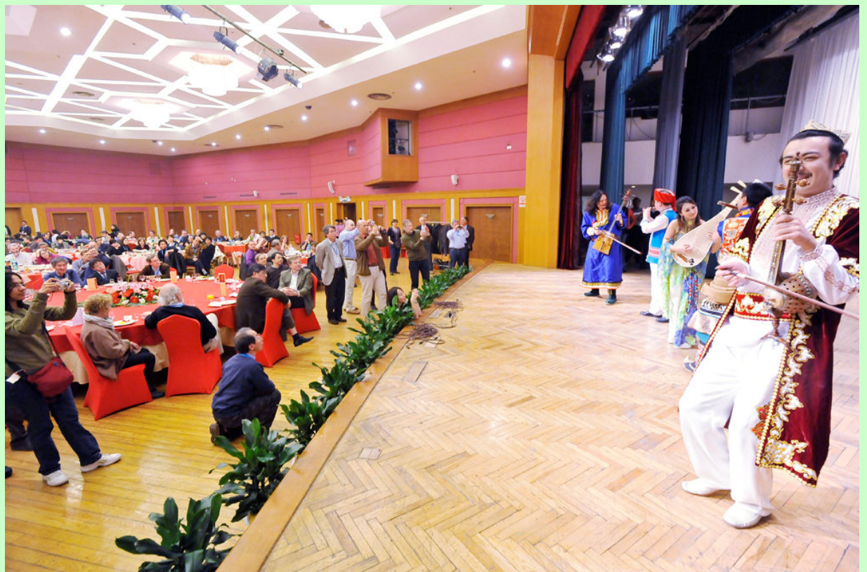
LCWS10, Friendship Hotel, Beijing