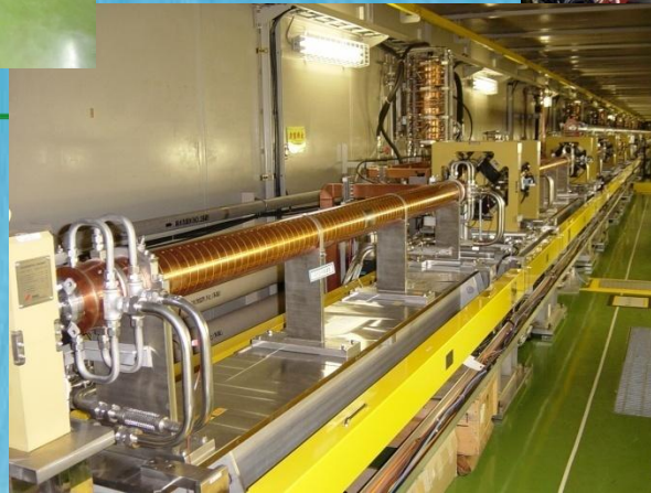
S-band Linac \Delta f ECS for multi-bunch beam