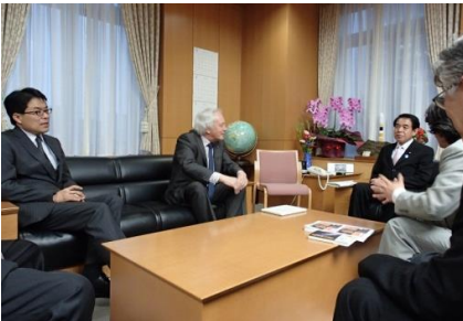
Mr. Shimomura, Minister of Education, Culture, Sports, Science and Technology,