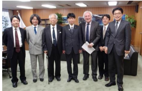
Mr. Yamamoto, Minister of State for Science and Technology Policy,