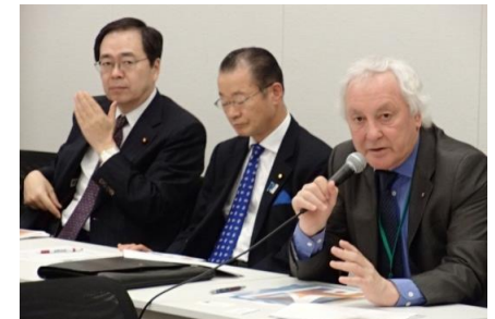
Lecture at Diet member caucus for ILC